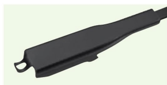
I&L / Pinch Tab Wiper Arm

Flat wiper blades come with M3 multi-adaptors that also fit multiple types of wiper arms, such as: