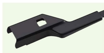
19mm PTB / Push Button / Push Lock / Pinch Tab Button / Top Lock Wiper Arm