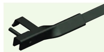
17mm & 22mm P&H / Side Lock / Slide Pin Wiper Arm

The M3 multi-adaptor can take the form of 4 different adaptors, giving it broad coverage.