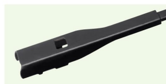
16mm Narrow PTB / Push Button / Push Lock / Pinch Tab Button / Top Lock Wiper Arm